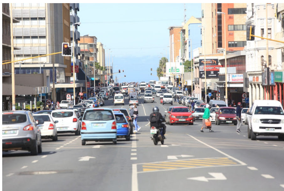
Pedestrian wearing face masks cross a busy street in Buffalo City Metropolitan Municipality in this file photo.

Covid-19 is putting immense pressure on metro budgets. On the one hand, they have seen a sharp decline in revenues. On the other, they have higher expenses for poverty relief, facilities in informal settlements, and safe public transport. The national government has promised R20bn to support all municipalities, but so far it has not indicated how the money will be spent. In any case, the funds are part of the adjustment budget, which means they will be available only from early August.